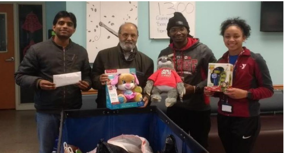
Donations made to Van Buren Shelter