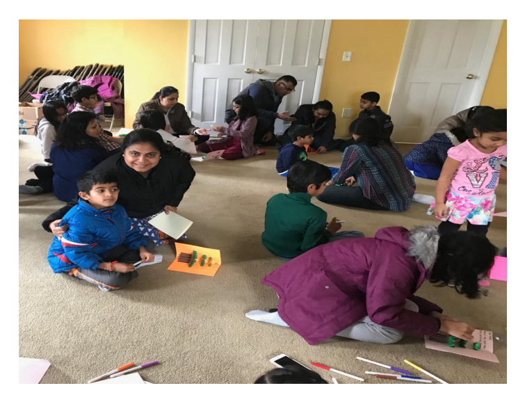
JCOCO kids creating cards